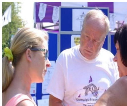
Outdoor Awareness Display